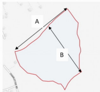
A = Bluff edge frontage, approx. 1390 ft. B = Approximately 1350 ft in depth.