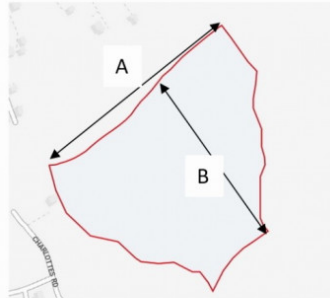
A = Bluff edge frontage, approx. 1390 ft. B = Approximately 1350 ft in depth.