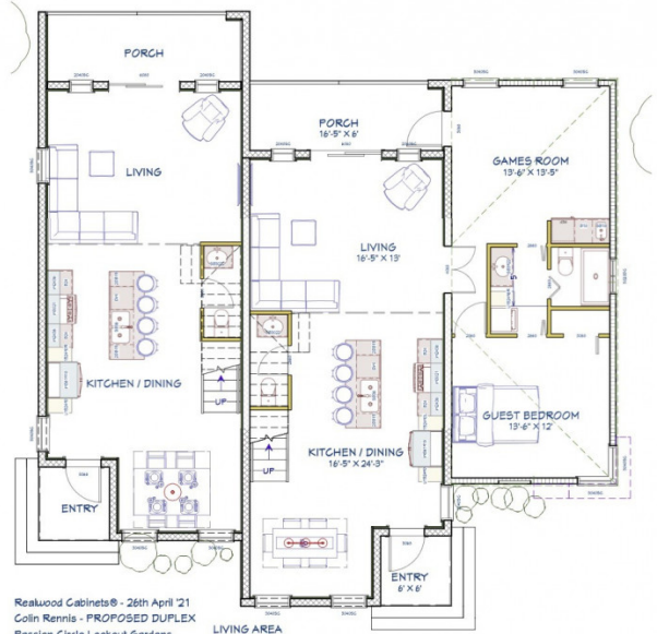
Reakwood Cabinets® - 26th April '21 Colin Rennis - PROPOSED DUPLEX Passion Circle Lookout Gardens, Boddan Tawn, Grand Cayman